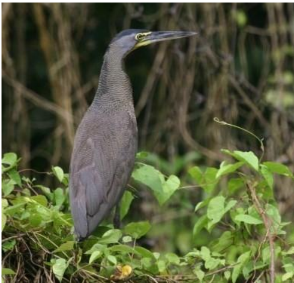
Bare-throated Tiger-Heron