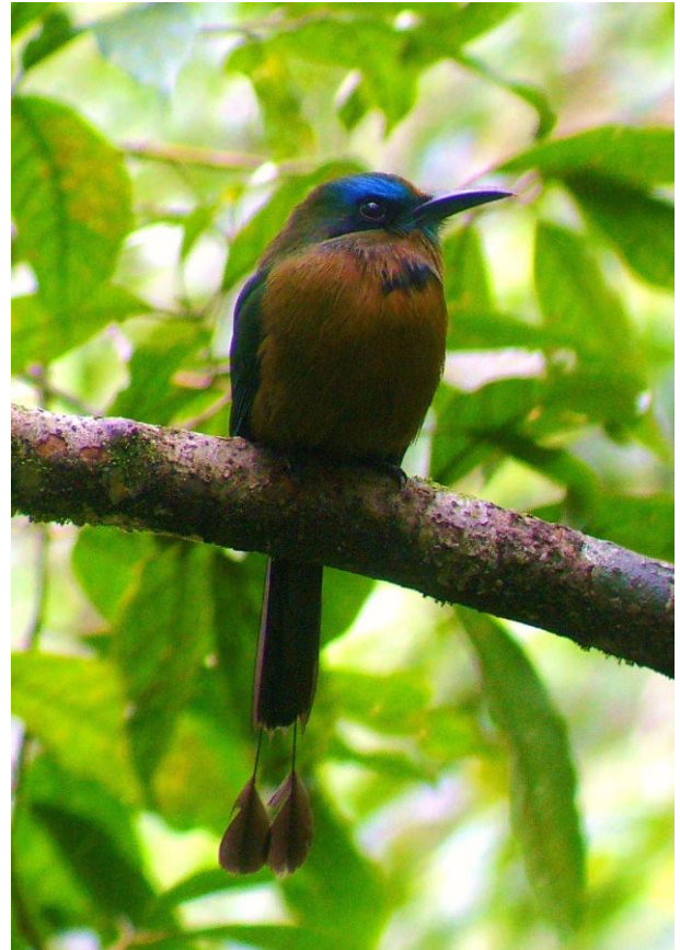
Keel-billed Motmot - - Robert Gallardo

Day 2 - Lancetilla Botanical Gardens to Olanchito This morning we will enjoy the full splendor of the Neotropics and witness a plethora of birds that are associated with lowland rain forests. During our visit to Lancetilla we will bird along the powerline road (perhaps synonymous with Panama's Pipeline Road). A slow 400-foot stroll along this side road often produces 60-80 species! Notable birds include Great Antshrike , Scaly-breasted Hummingbird , Tawny-winged Woodcreeper , Olivaceous Piculet , Yellow-bellied Tyrannulet , and Rufous-tailed Jacamar . Other species typically found there or elsewhere in the gardens include Smoky-brown Woodpecker , Cocoa Woodcreeper , Black-headed Trogon and White-collared Manakin . After lunch we will drive to Olanchito, crossing the lower eastern section of the Nombre de Dios mountain range, host to the splendid Pico Bonito National Park. We will have a home style dinner tonight.