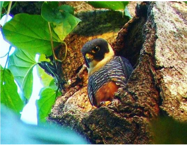
Bat Falcon

Dates Thursday, 27 January through Friday, 4 February 2011: 9 days & 8 nights. Copan Ruinas Extension, Friday, 4 February through Monday, 7 February 2011: 3 additional days for the extension.