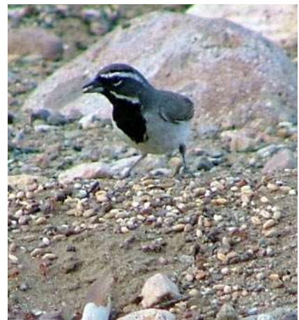
Black-throated Sparrow - - Bob Coley

Clark's Grebe Olive-sided Flycatcher Western Grebe Vermilion Flycatcher Common Black-Hawk Scissor-tailed Flycatcher Gray Hawk Mexican Jay Zone-tailed Hawk Verdin Prairie Falcon Bushtit Montezuma Quail Canyon Wren Scaled Quail Cactus Wren Gambel's Quail Black-tailed Gnatcatcher Inca Dove Crissal Thrasher Snowy Plover Phainopepla Western Screech-Owl Gray Vireo Elf Owl Hutton's Vireo Common Poorwill Colima Warbler Lesser Nighthawk MacGillivray's Warbler White-throated Swift Nashville Warbler Lucifer Hummingbird Pyrrhuloxia