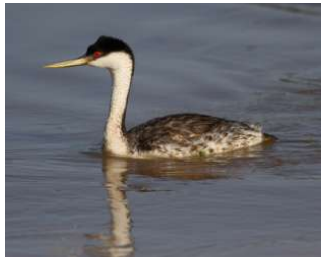
Western Grebe