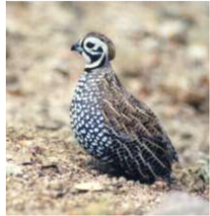
Montezuma Quail

Painted Bunting Varied Bunting Canyon Towhee Black-throated Sparrow Rufous-crowned Sparrow Black-chinned Sparrow Scott's Oriole Western Tanager Lesser Goldfinch