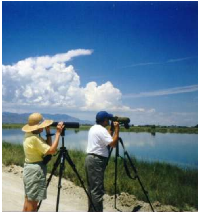
Scoping and scanning Willcox Twin Lakes , an absolute magnet for aquatic birds.