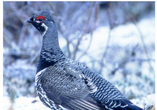
Spruce Grouse - - James C. Leupold

Arctic Tern Black Tern Bald Eagle Swainson's Hawk Merlin Gray Partridge Spruce Grouse Willow Ptarmigan Short-eared Owl Great Gray Owl Black-backed Woodpecker Alder Flycatcher Western Kingbird Gray Jay Boreal Chickadee Swainson's Thrush Northern Shrike Bohemian Waxwing Connecticut Warbler