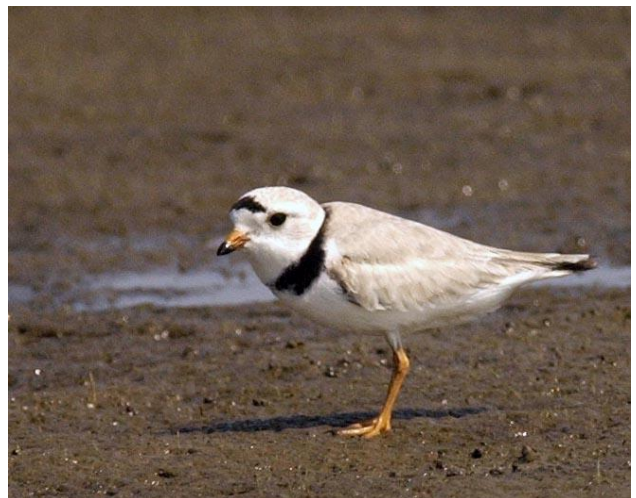
Piping Plover on the beach. - - Tom Amico

Black-capped Petrel American Avocet Cory's Shearwater Black-necked Stilt Great Shearwater Red-necked Phalarope Audubon's Shearwater Pomarine Jaeger Wilson's Storm-Petrel Gull-billed Tern Brown Pelican Sandwich Tern Little Blue Heron Sooty Tern Tricolored Heron Bridled Tern White Ibis Black Tern Glossy Ibis Black Skimmer Virginia Rail Marsh Wren Clapper Rail Brown-headed Nuthatch Piping Plover Black-and-white Warbler American Oystercatcher Prairie Warbler Marbled Godwit Pine Warbler Hudsonian Godwit Seaside Sparrow