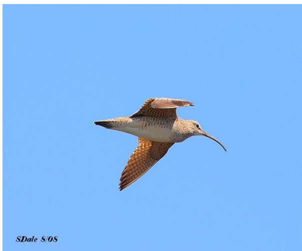
Whimbrel heading south. -- Steve Dale

Deposit A $500 deposit will assure your reservation on the tour. The balance is due 6 July 2017. EARLY RESERVATIONS ARE APPRECIATED to secure your spot on the pelagic trip.