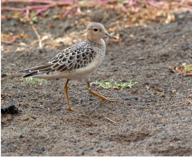
Buff-breasted Sandpiper - - Tom Amico

4 We will spend the day at sea in the nearby waters of the Gulf Stream with Brian Patteson. Some of the species that we may see include Black-capped Petrel , Wilson's Storm-Petrel , Sooty and Bridled Terns , Cory's and Audubon's Shearwaters , and Pomarine Jaeger . Whales , dolphins , and sea turtles are likely. Some unusual species such as Band-rumped Storm-Petrel , Long-tailed Jaeger , and South Polar Skua are well within reason. There is always the chance for something VERY unusual, perhaps a beautiful White-tailed Tropicbird (seen on our 2007 tour), Herald Petrel , or White-faced Storm-Petrel .