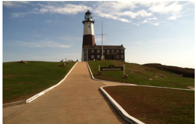
Montauk Point Lighthouse