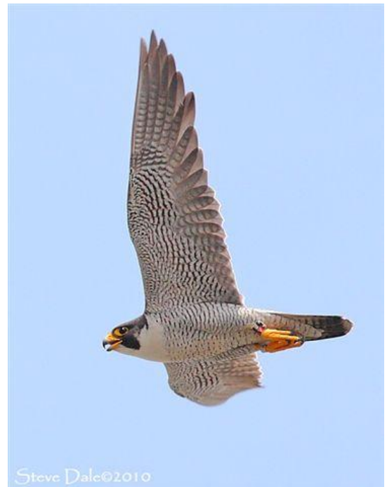
A magnificent Peregrine Falcon

Curlew Sandpiper Gray-cheeked Thrush Ruff Orange-crowned Warbler Black-headed Gull Blue Grosbeak Roseate Tern Saltmarsh Sparrow Parasitic Jaeger Seaside Sparrow Philadelphia Vireo Red Crossbill