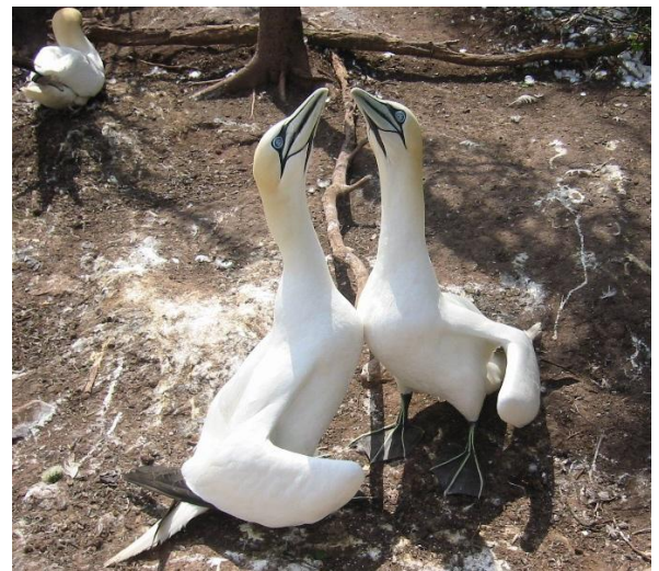
We'll see Northern Gannets nesting on Bonaventure Island, 30,000+ of them! - - Ron Simpson, tour participant

Northern Goshawk Northern Saw-whet Owl Golden Eagle Black-backed Woodpecker Glaucous Gull Bicknell's Thrush Yellow Rail Red Crossbill Atlantic Puffin Common Redpoll