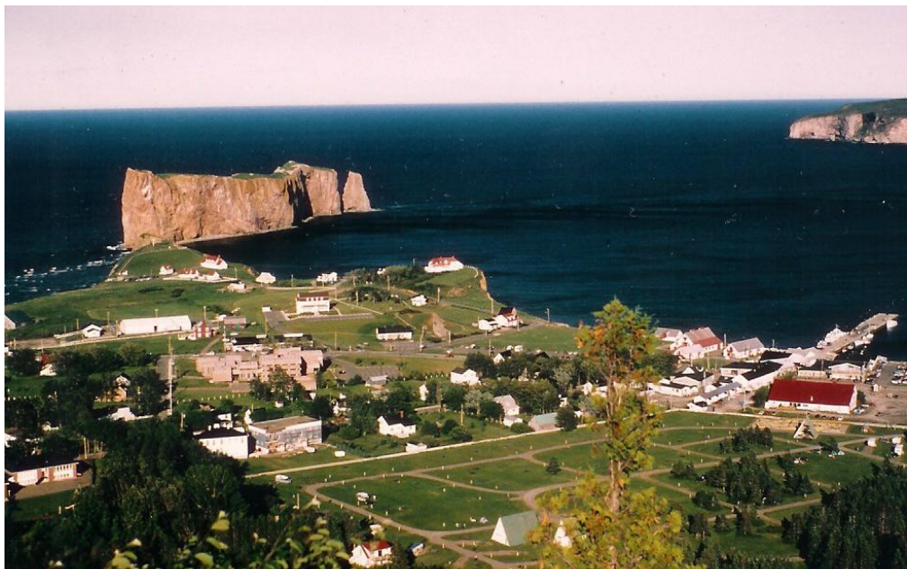
The Village of Percé, as viewed from Mount Ste. Anne - - FANTASTIC! - - Bob Schutsky