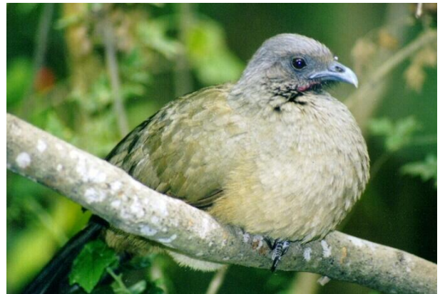
Plain Chachalaca, abundant and noisy! - - Diana Schnelbach, tour participant

1 **Plan to arrive at Corpus Christi Airport by early afternoon. We'll drive north along the coast where species such as Roseate Spoonbill, Long-billed Curlew, American White Pelican, Reddish Egret, Vermilion Flycatcher, and Neotropic Cormorant are just a few of the many exciting birds that we may see. Overnight in Corpus Christi. [**See bottom of itinerary]