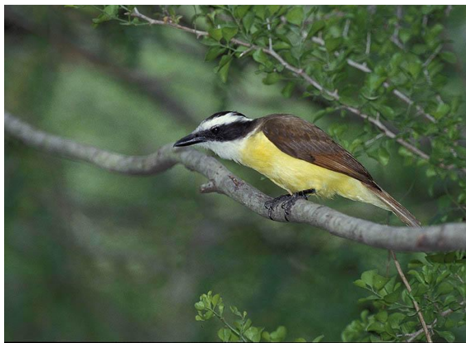
Great Kiskadee is a large, vividly marked flycatcher.

6 We’ll have a full morning to visit Estero Llano Grande State Park. It is known for its rarities, such as White-throated Thrush , Clay-colored Thrush , and the very unusual Gray-crowned Yellowthroat . You will be at the McAllen Airport for your mid-afternoon flights home.