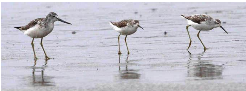
Common Greenshank (top left), two MARSH SANDPIPERS (top right), and a Garganey (below) coming in for a landing. Three great species!