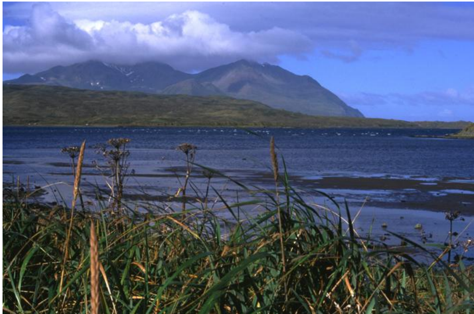
Clam Lagoon is THE prime birding location on Adak Island. - - John Puschock

https://www.google.com/maps/d/u/0/edit?mid=zDJlwFKF8JcU.kiOlj6j8_WNA