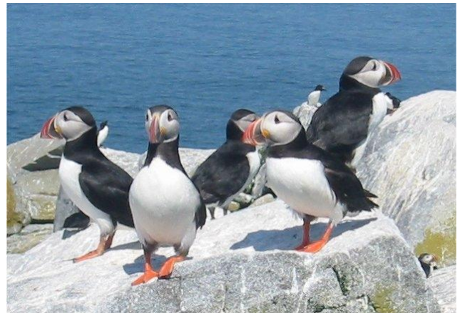
Atlantic Puffins are likely offshore.

Red-necked Grebe Philadelphia Vireo Sooty Shearwater Blue-headed Vireo Manx Shearwater Nashville Warbler Northern Gannet Black-throated Green Warbler Great Cormorant Blackpoll Warbler American Bittern Wilson's Warbler Common Eider Rose-breasted Grosbeak Merlin Dickcissel Peregrine Falcon Savannah Sparrow Black-legged Kittiwake Lark Sparrow Pomarine Jaeger Lincoln's Sparrow Black Guillemot Swamp Sparrow Atlantic Puffin Fox Sparrow Yellow-billed Cuckoo Indigo Bunting Hermit Thrush Baltimore Oriole Boreal Chickadee Purple Finch