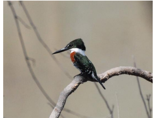
Green Kingfisher (male)

Buff-bellied Hummingbird Ringed Kingfisher Green Kingfisher Ladder-backed Woodpecker Couch's Kingbird Vermilion Flycatcher Great Kiskadee Cave Swallow Green Jay Curve-billed Thrasher Orange-crowned Warbler Black-throated Gray Warbler Yellow-headed Blackbird Brewer's Blackbird Bronzed Cowbird