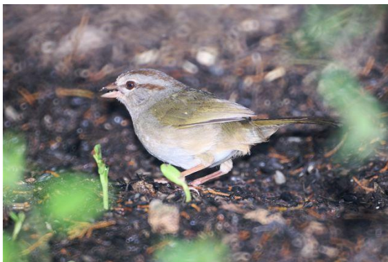
Olive Sparrow is sometimes elusive. -- Barry Ulman, tour participant

Deposit A $600 deposit will assure your reservation on the tour. The balance is due 9 December 2017.