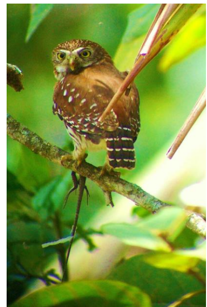
Ferruginous Pygmy-Owl by R. Gallardo [Lizard in left foot!]

8 A drive west will take us to the Falcon Dam area for a full day of birding. We will attempt to see Black-tailed Gnatcatcher, Scaled Quail, and Hooded Oriole . Salineno is often very good for Muscovy Duck, Audubon's Oriole, Ladder-backed Woodpecker, Common Ground-Dove, Zone-tailed Hawk, and Gray Hawk . There may be Red-billed Pigeon and Groove-billed Ani . Falcon State Park should produce a few Vermilion Flycatchers, Pyrrhuloxia, Nashville Warbler, and Greater Roadrunner . And perhaps the very rare Roadside Hawk will return. Second night in Rio Grande City.