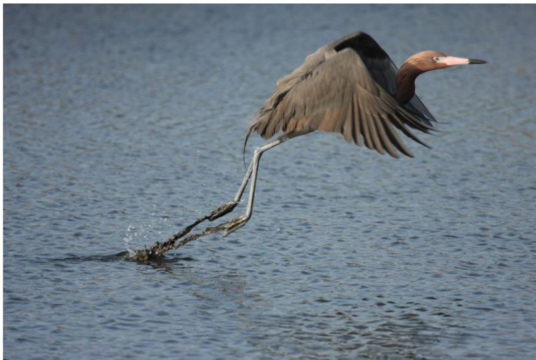
Reddish Egret, what a beauty!