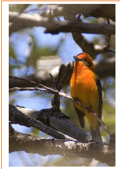
Flame-colored Tanager