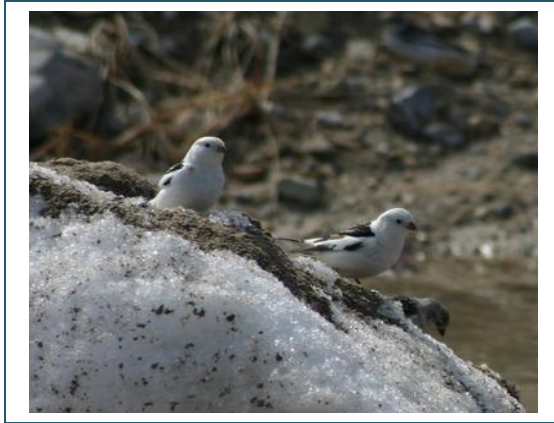
Snow Buntings